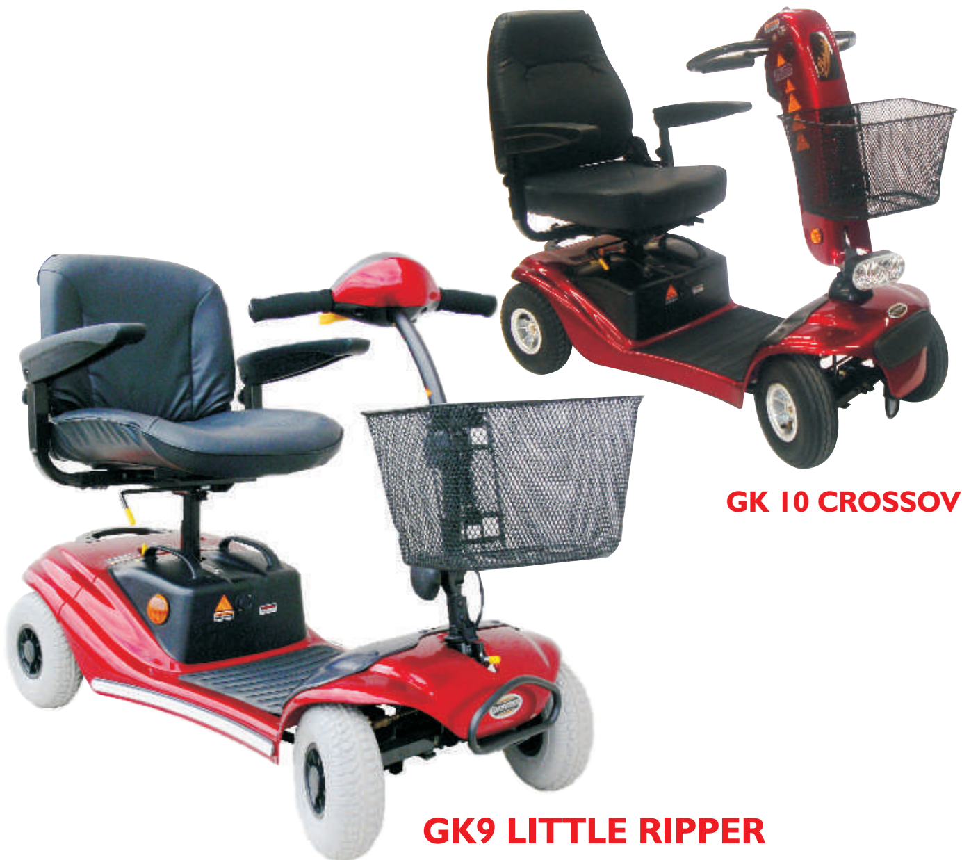
GK 10 CROSSOVER